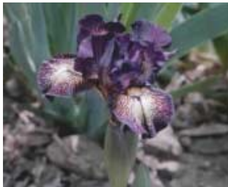
Chuck Chapman's SDB, Ruby Eruption

Perry Dyer's aptly named Crystalline Entity is a floriferous clump of large broad white pearlescent flowers with medium blue beards. The round tailored form adds to the smooth appearance. The clump has aesthetic appeal, despite what we are taught about proper proportion. We must use our imaginations to appreciate this futuristic being from outer space which has invaded the guest bed. In contrast, nearby was Dave Niswonger's Bordeaux Pearl , a cultivar which is perfection for a smaller flowered SDB. The color is vivid: burnt violet and light yellow plicata with a light blue beard. The height and foliage are also smaller, in proportion to the flower size. Positioned a bit further down the bed was Chuck Chapman's Ruby Eruption , a larger plicata in medium yellow edged darkest violet red. Height is near the top end of SDB's and proportion is good. The flower color is deep and eye catching while the blossoms have substance rarely seen in the SDB class! Nearby but equally beautiful was the lightest of plicata's, Perry Dyer's Bleached Blonde . Its colors are white and light pastel yellow, with the yellow intensifying near the hafts. The flowers have a sparkling finish.